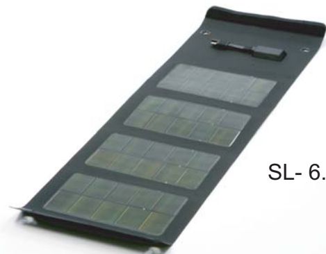
SL- 6.5 Watt